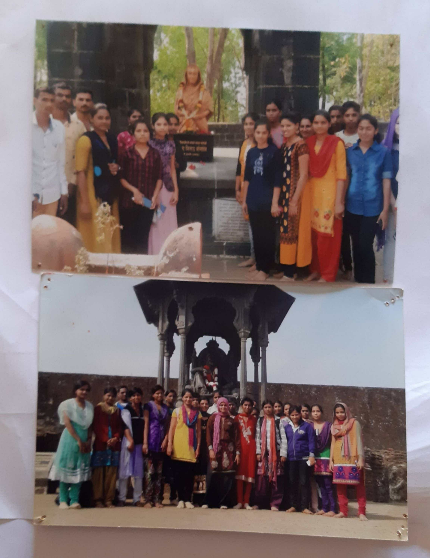
Arts & commerce college, vaiduj' Department of history acadmic year. 2018.19. Visit to Raigarh fort