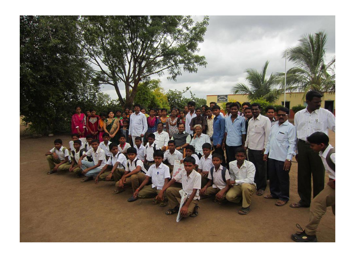
Visit to Sadguru orphanage,